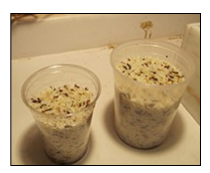
Pour Rice into Con tainers for Measuring