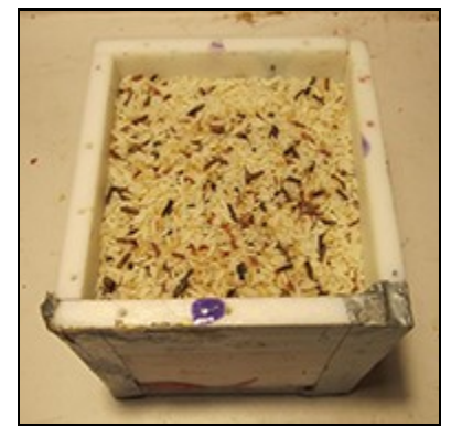
Rice Poured Over Blank to Measure Volume