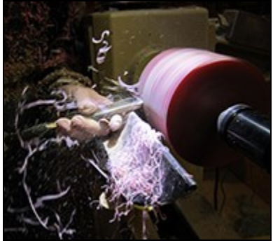
Rough the Blank on the Lathe