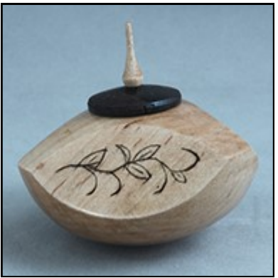
Fred Bohle Maple Rock-a-Bye Box