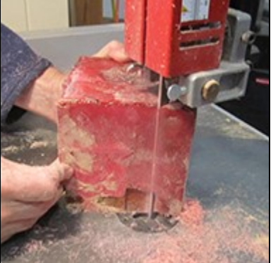
Saw the Blank on the Bandsaw