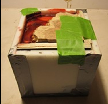
Mold After Pouring and Setting up