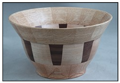
Steve Hlasnicek Oak, Maple, Walnut