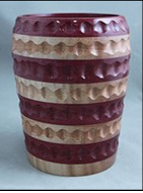
Fred Bohle Purple Heart, Maple Rose Engine Work