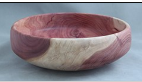
Dominic Cavallo Cedar