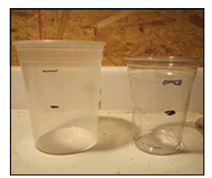
Mark Containers: At Top and Halfway