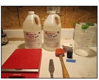
Tools & Supplies For Mixing Resin