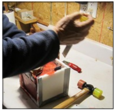
Remove the Blank from the Box