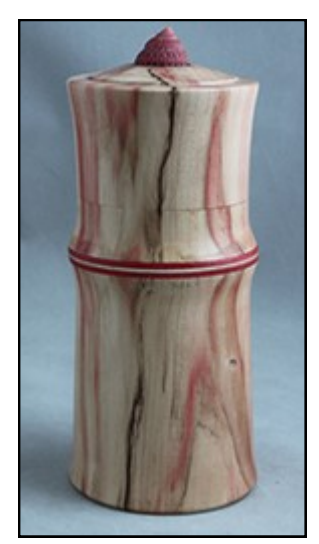
Cindy Murfey Spalted Box Elder