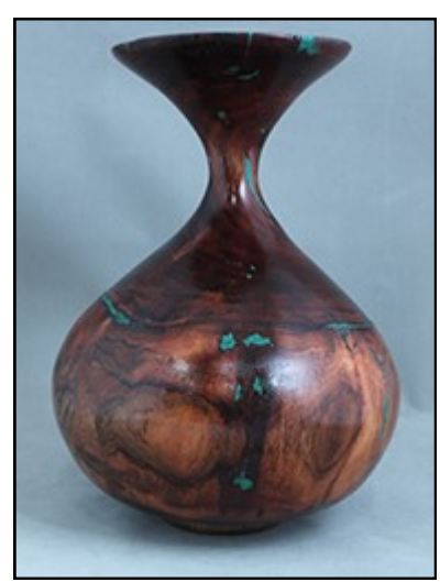
Carl Schneider Tamarind, Turquoise